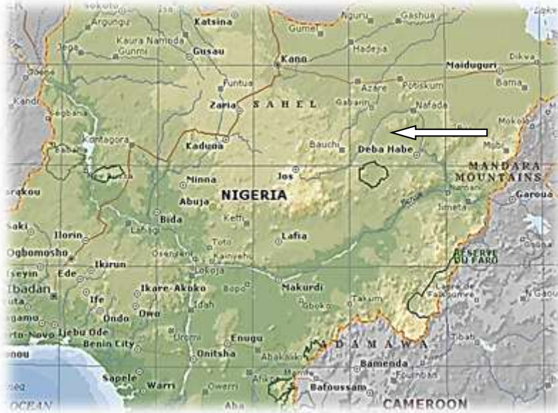
Map of Nigeria showing Zaria arrowed.