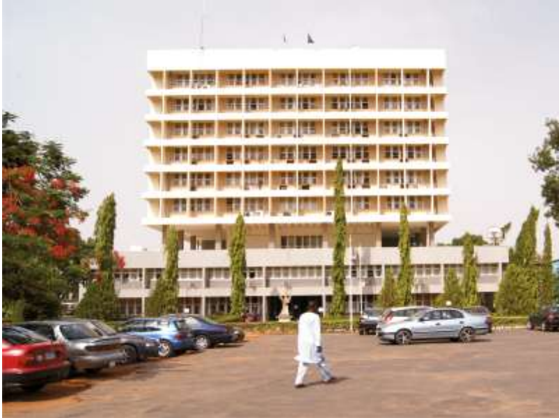
The University Senate building