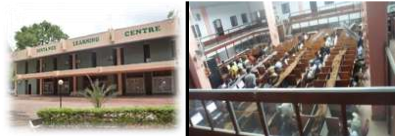
Frontage and Interior view of the Distance Learning Centre

The Distance Learning Centre of the Ahmadu Bello University (see pictures) is currently located in the Ahmadu Coomassie Building (former ABU Bookshop) adjacent the Senate Building on the Main Campus.