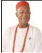
His Majesty, Nnaemeka Alfred Ugochukwu Achebe, CFR Chancellor. (Obi of Onitsha)